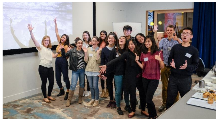
Student Green Impact auditors at University of Melbourne, Australia

In a challenging political and global climate, it is unions, universities, colleges and communities leading the way on sustainability. Students' unions have excelled, implementing and embedding good environmental practices, while expanding their engagement with sustainability to integrate social, political and economic factors. Here are some highlights from the exciting and progressive achievements from across the movement: